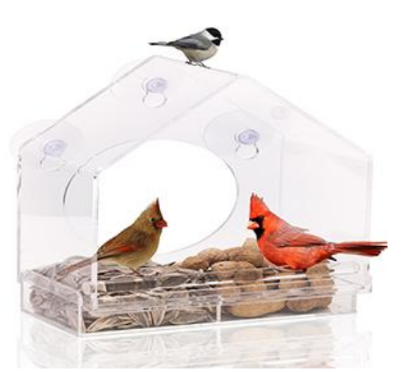
Birds-I-View Window Feeder

For a limited time, you can enjoy a 10% discount by using the code FEEDSHEET10 at checkout.